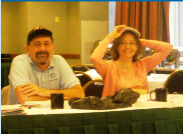
Chair of ASFPM